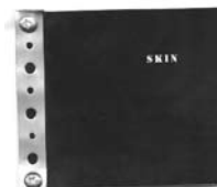
Skin - 1997