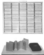
fOnEtiks - 1999