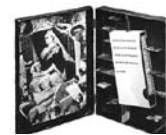
MYTHE OU MYTHOLOGIES (Myth or Mythologies) - 1991